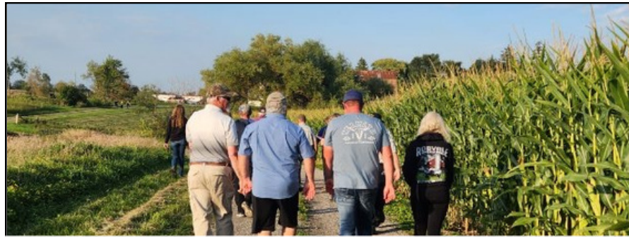
HSCIA members tour the fields during the summer barbeque

Honouring significant restoration efforts, CH offered a Watershed Stewardship Award to an agricultural property.