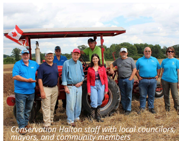
Conservation Halton staff with local councilors, mayors, and community members

In 2022, we attended the Halton Plow Match to promote cover crops through an interactive soil infiltration display, and to connect with the local agricultural community. Thanks to this event, we were invited to the Soil and Crop Association AGM in January 2023 to continue these discussions.