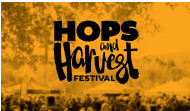
Figure 3: Hops and Harvest Festival Logo

County of Wellington and Township of Puslinch continue to require a Drinking Water Threat Disclosure Report where significant threats may be present near municipal wells. This built on existing Official Plan policies since 2008 and Halton-Hamilton policies. See the website wellington.ca