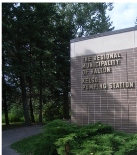
Figure 2: Kelso Drinking Water System Pump Station

During the 2022 reporting year, 5 site inspections were conducted. While COVID restrictions have eased, the Risk Management officials and inspectors continued to safely conduct inspections (drive by threat verification). Implementation of risk management plan policies is given a progress score of P: Progressing well.